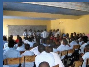
Enjoying the GEC concert in the new classroom. Doors open between the 2 classrooms making a really versatile space

In January 2015, after completing college, he starts a community based organization called the Hands of Help Children Organization and identifies three very needy kids. Their mandate is to support and promote the welfare of less privileged children through the provision of education and the three basic needs. At the moment, the organization can only provide for education and the two basic needs that is food and clothing, accommodation is a future aspiration for them. In the area they operate, they act as watchdogs of the less privilege children in the slum areas. I can almost identify why he would choose to help people he didn't even know but I still ask, just so I can put it here in his own words. 'I am not an orphan, I have both parents but I went through such a rough childhood. My parents were there but they couldn't help me. I am not alone, there are other kids going through the same things I did right here in the community, and there is no one to help them or take care of them...,they don't have a voice to speak themselves. That is what pushed me to start this organization, to help someone, to be their voice', he says.