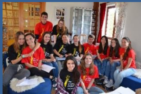
Our fantastic team of students!