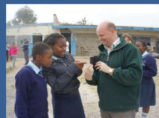
It's always a pleasure to get to know the kids at GEC

Congratulations to the fantastic runners in the Brussels 20k 2016. They raised just under 20,000euros (a euro/metre!) - an amazing amount which will keep GEC running for another year. Thank you so much!