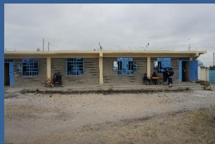
Brand new classrooms at GEC. They have been built so we can add an extra storey as soon as we raise the funds!