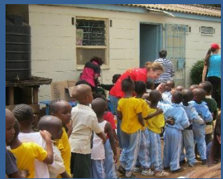
Assisting with the Green Pastures medicals