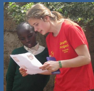
Helping to read a letter from a sponsor